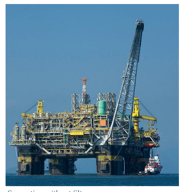
Separation without filters

1230 Avenue of The America's New York City, NY 10020