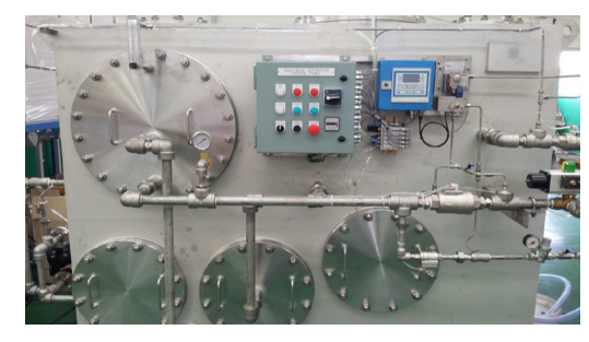
MU-30 (Stainless Steel Model)

Filterless operation and the only separator capable of removing dissolved contaminants, it was designed for the rigors of the oil field and is a land based two phase oily water separation unit, like the Crystal Sea, requires no filter and with no internal moving parts is designed to run 24 hours a day in the harshest environment. Crystal can keep up with the most aggressive production quota's and never gives up. Our separators are designed to run non stop 24/7. Ten years of continuous operation is not too demanding, Crystal can handle any production schedule you throw at it. Each stage is devised to quickly remove oil particles of a certain size and to render the liquid cleaner for the next stage. Furthermore, it also precludes undue contamination and clogging of various stages by oil, resulting in trouble-free and inexpensive automated operation. There are no limitations on oil particle size, and Crystal quickly separates emulsions and oils with very high densities. Our separator has an ultra compact footprint and is incredibly versatile. It is extremely customizable and can be utilized in a wide range of applications such as sand washing plants, oil platforms, wastewater treatment plants and salt mines. We encourage you to visit one of our units in the field and look forward to custom building any size for your specific applications.