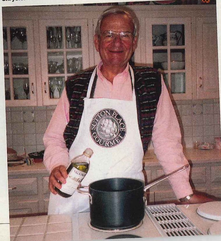
Chrysler's CEO uses his own olive oil to make a spaghetti sauce for the kids.