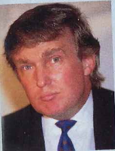
DONALD TRUMP has a 10% stake in the outcome of a $1.8 billion suit filed by . . .